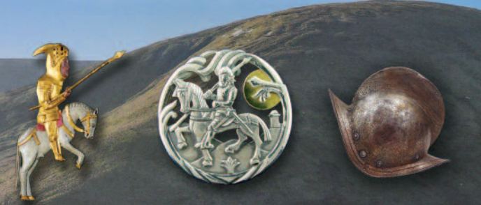
Including The Borderlands Museum