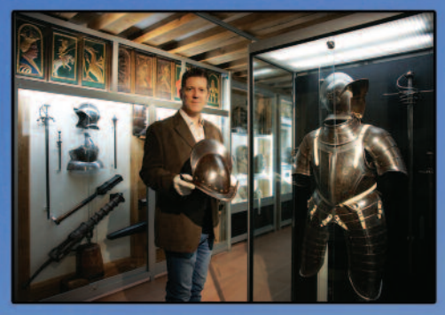
The Borderlands Museum is a private shrine to Border history

A world-class exhibition of unique artefacts from the Iron Age to the age of the Border Reiver, many of which are on private loan - never before having been seen by the public