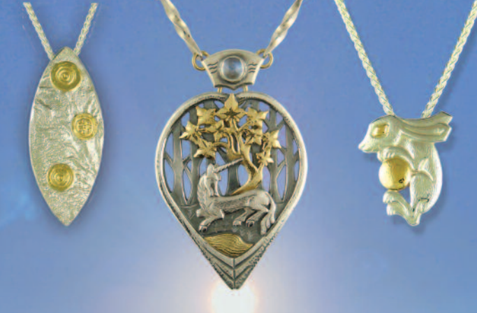
Handfasting - betrothal and renewal of vows