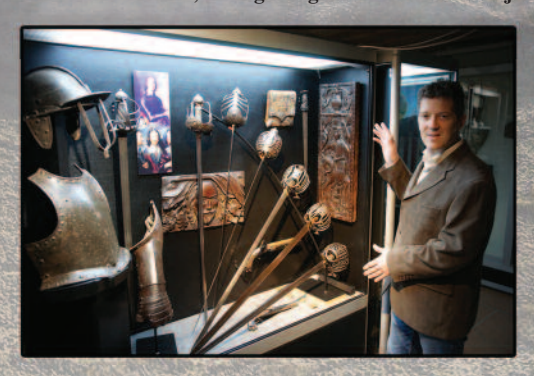
An hour and a half should be allowed for an immersive guide Slots of this timescale are available to book throughout the day For a bespoke experience, private curator-led visits can also be arranged by appointment

The audiovisual guide available tells the incredible story of the Anglo-Scottish Border and its people - and their impact around the world, through original artefacts and objects